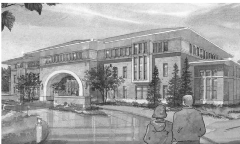
The architect rendering shows the new college facility that will be constructed in South Sioux City. The project is a joint effort between Wayne State College and Northeast Community College.